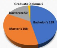
302 Programs of Study in 2024

■ Bachelor's 139 ■ Master's 108 ■ Doctorate 50 ■ Graduate Diploma 5