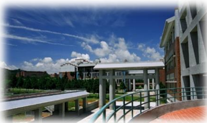
College of Education