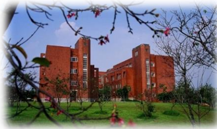
College of Science & Technology