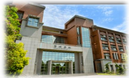
College of Management