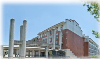
College of Humanities